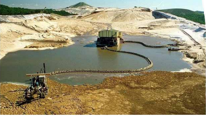
The CCC will not investigate a Quandamooka complaint about Stradbroke Island sandmining advertising and the Ashgrove electorate, Photo: Robert Rough

New North Stradbroke Island sand mining laws are drafted without the consent of the Native Title holders.